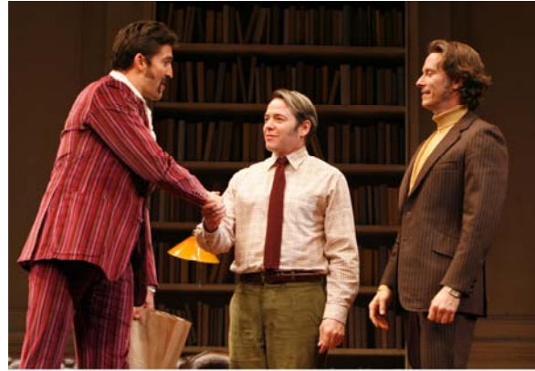
Roundabout Theatre Company's THE PHILANTHROPIST Pictured (l-r): Jonathan Cake, Matthew Broderick, Steven Weber